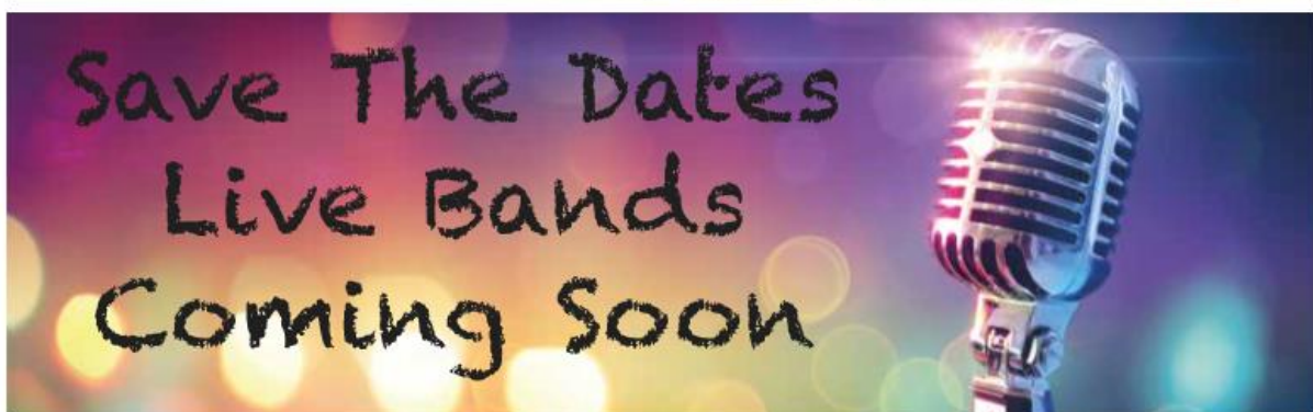
Table Booking Available Online www.theviewnewburgh.co.uk